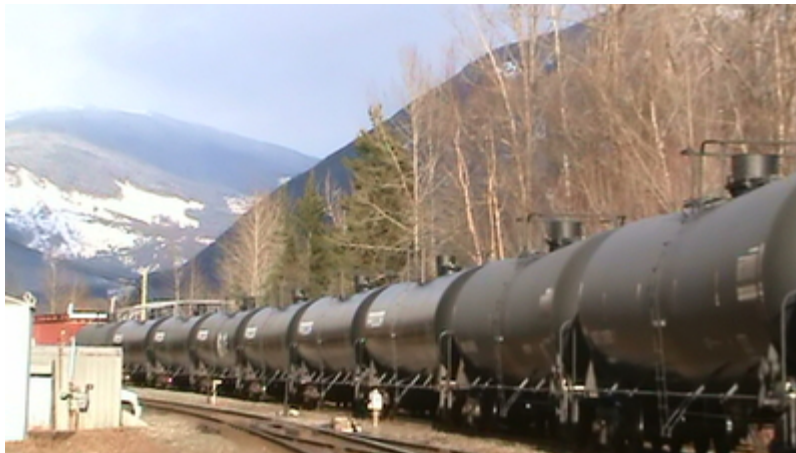
In this picture you can see the top of the Old Skeena bridge in the distance and the last chip car connected to the tankers near the rock bluff. 22