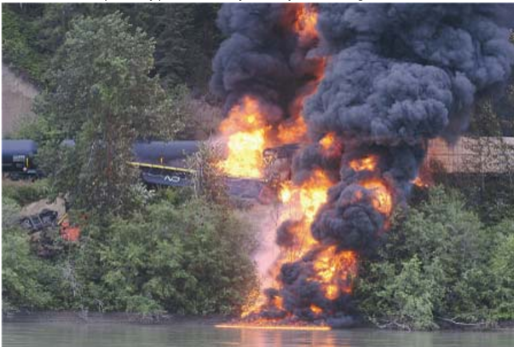
post-collision fire and fuel entering Fraser River

The media reported that an hour and a half passed before a CN employee uncoupled and pulled five tank cars away from the burning train. Once the tank cars were moved away from the scene, CN refused