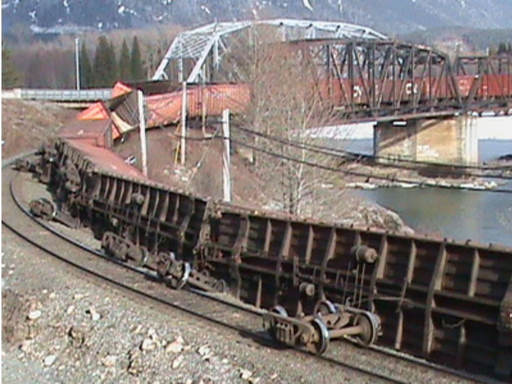
REPORTING · 2nd April 2009 ANOTHER CN TRAIN DERAILMENT ON SKEENA